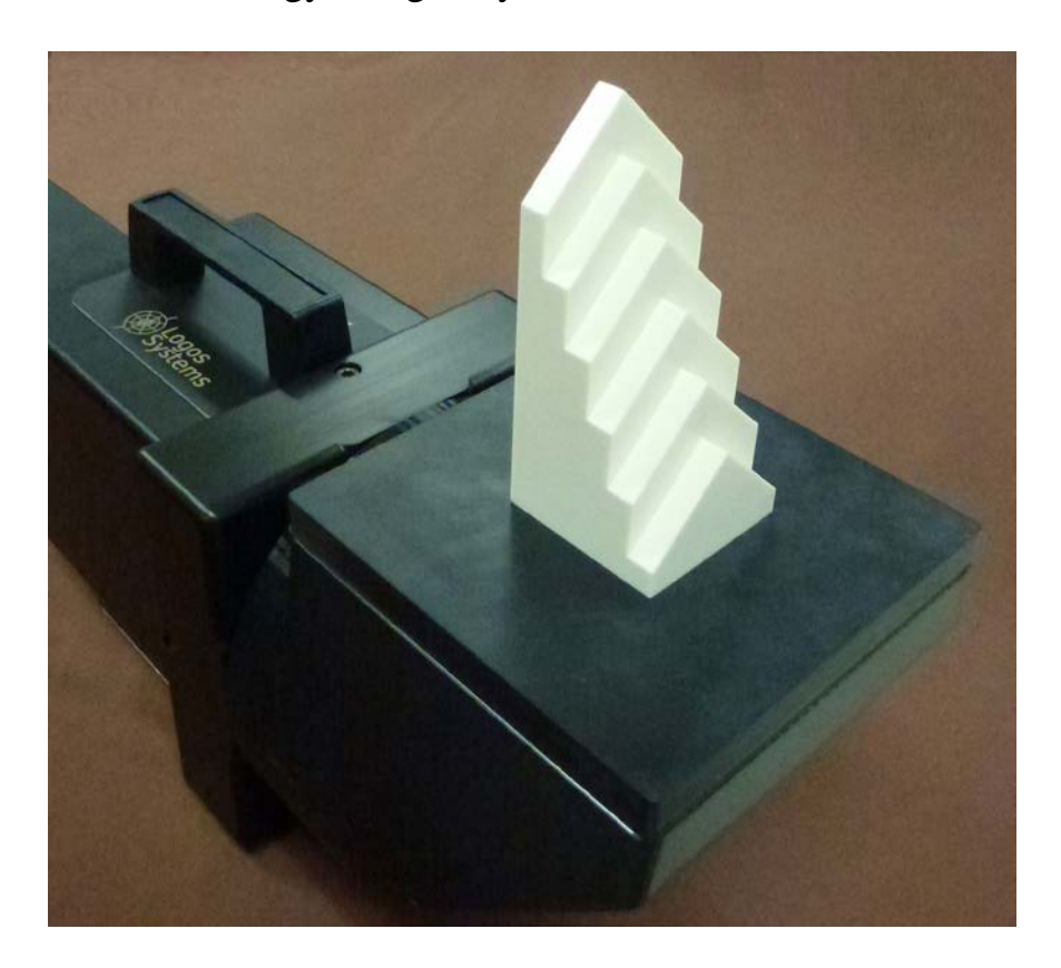
LCW-140 on the XRV-2020A Scintillator Camera Phantom

The LCW-140 is a tissue equivalent wedge that can be used to measure proton and X-ray beam depth dose relationships. It was specifically designed to quickly and accurately measure the proximal and distal edges of an ion beam's Bragg peak. The height of 140 mm allows proton beam energies up to 130 MeV to be directly measured.